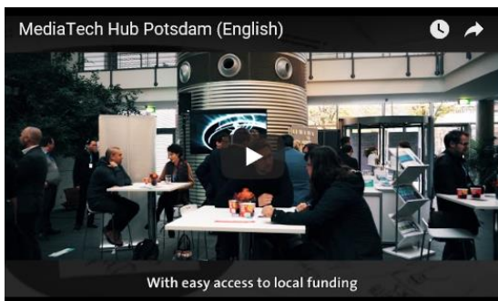
MediaTech Hub Trailer

MediaTech Hub Potsdam was named one of 12 digital hubs in Germany by the Federal Ministry for Economic Affairs and Energy in June 2017. The initiative aims to consolidate Germany's position as a digital centre and an innovator. The hub concept is based on the idea that close cooperation between companies and founders can encourage innovation in the digital age. www.de-hub.de .