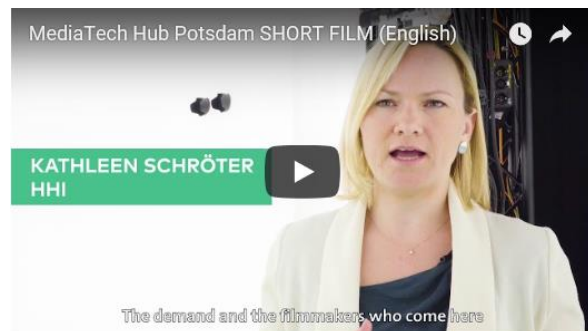
The Voices of MediaTech Hub

https://www.youtube.com/watch?v=6_G-ryFpn6s